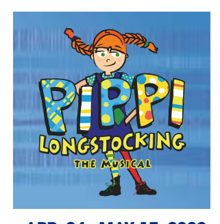
APR. 24 - MAY 17, 2020

Of all the stories told about Neverland, Tinker Bell's has gone untold. Until now. Witness the origin of one of the most famous fairies in literature, from her first encounters with cherished children's characters like Peter Pan, Captain Hook, and Wendy Darling, to her triumph at the Battle for Neverland.