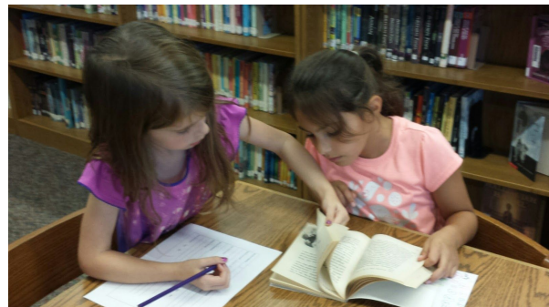
The 2nd-graders spent a day as "medical residents," diagnosing "sick" books and deciding whether they could be fixed or needed to be replaced.